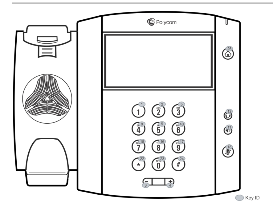
Table 9: Default Key ID by Function<sup>1</sup>