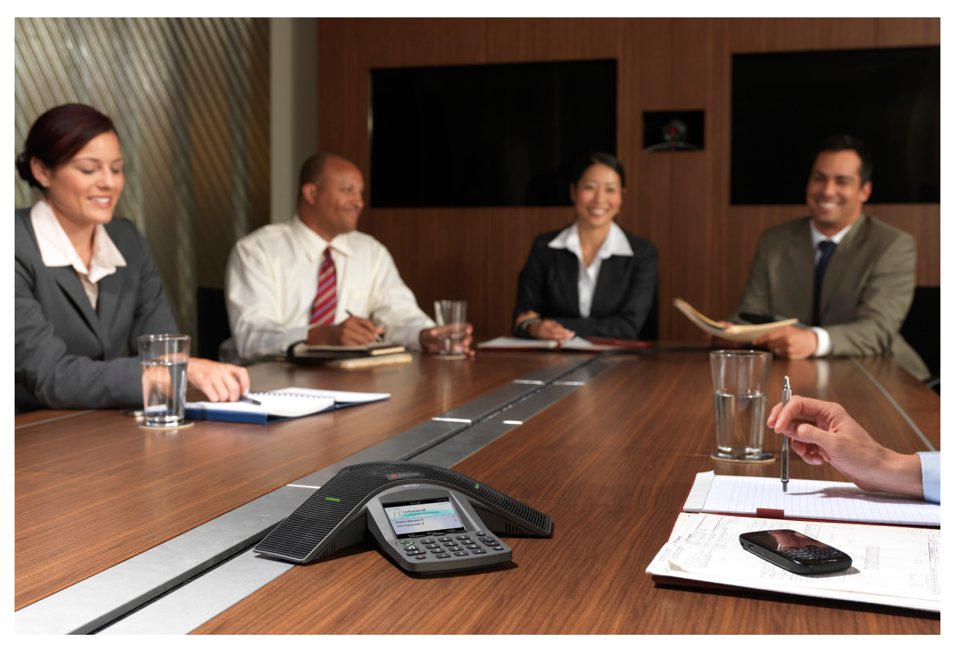
Polycom CX3000 IP Conference Phone: the only conference phone optimized for Lync