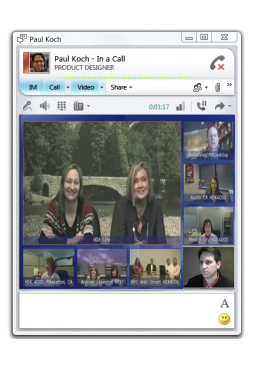
Video integration with Microsoft Lync